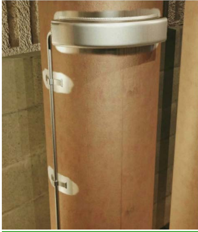
Proper routing with clips