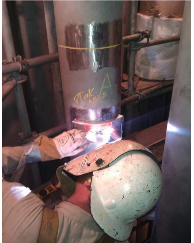
Trained specialist installing sensor

Today, many major refiners, process licensors and furnace manufacturers rely on WIKA/Gayesco services to provide tubeskin thermocouple systems for them. Can we design a system for you?