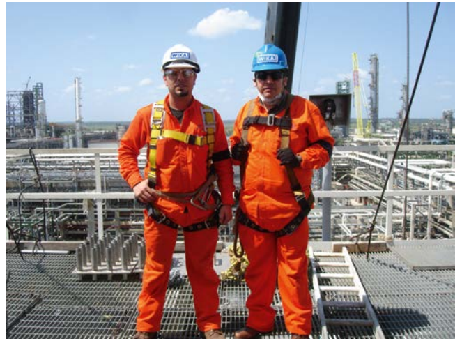
On-site installation crew

With WIKI/Gayesco services you can be sure that you have start-to-finish support. From initial on-site consultation to installation we have a custom-designed solution for you.