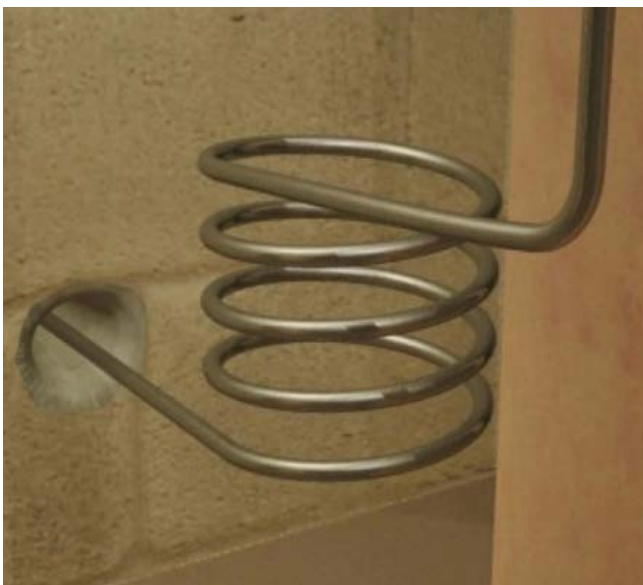
Expansion coils exiting the furnace