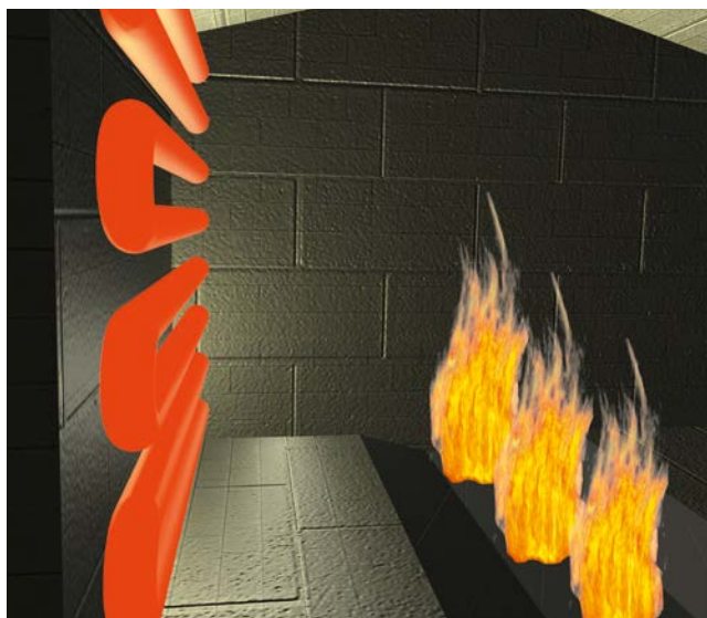
Direct radiation section

The convection heat section is located above the direct radiation section. In this area the heat is not as intense and the tubes are typically not subjected to direct flame. Here the tubes are typically 150 - 230 mm (6 - 9") apart inside the furnace, which sometimes makes it difficult to attach tubeskin thermocouples. Typically tubeskin thermocouples are only installed on the bottom row (shock tubes).