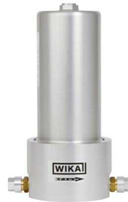
Portable SF 6 filter unit, model GPF-10